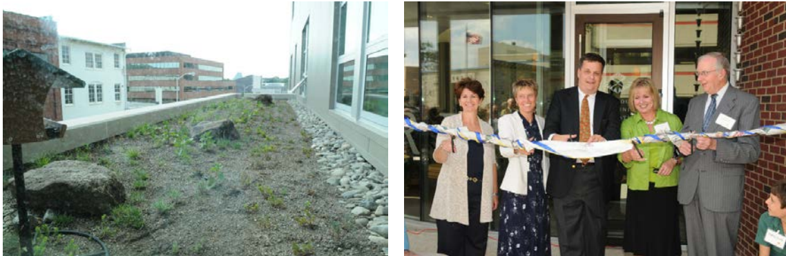
A green roof at the Community Foundation headquarters, at left. The building was dedicated in 2009, at right.

But in this case, “green” refers not to the color but to the environmentally-friendly aspects of the Community Foundation’s building at 237 Court Street, which opened in 2009.