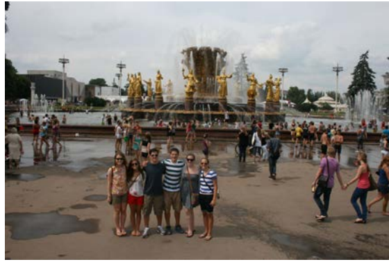
A 2012 visit to Russia with some YACsters

The teenagers also do their own fundraising with the hopes of permanently endowing the program. By soliciting members of the community for funds, YACsters have raised over a quarter of a million dollars.