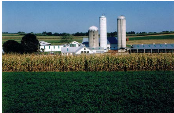
A Berks County farm